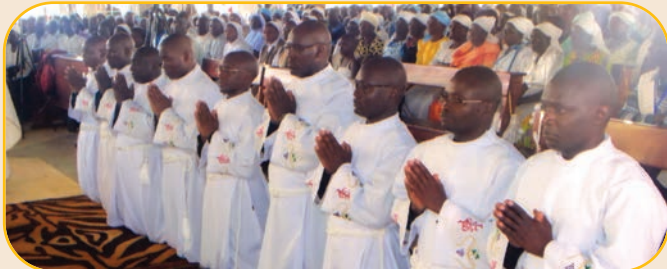
The candidates prepare to prostrate for The Litany of Saints