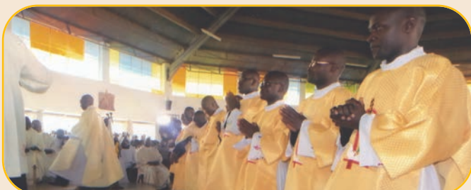
The newly ordained deacons fully vested