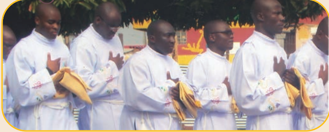
Candidates for Diaconate processing for ordination