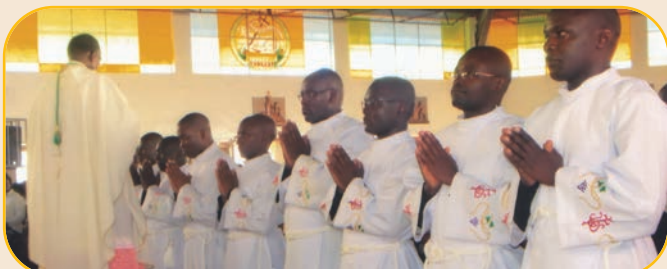
The laying on of hands by the Bishop