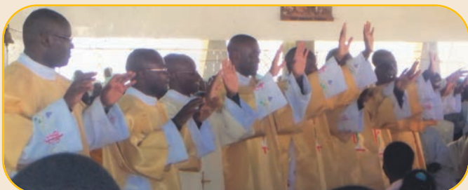
The newly ordained deacons acknowledging greetings from the congregation

St. Mathias Mulumba Seminary Tindinyo, P.O. Box 900, Kapsabet, Kenya 6-1-2019