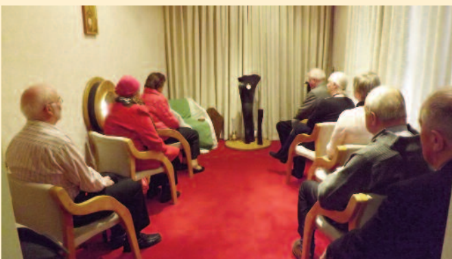
The Oratory at the Society's House in Merrion Square where visitors, especially those attending meetings, are invited on arrival to spend a while in private prayer.